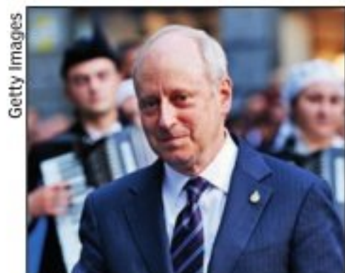
Michael J Sandel said the solution lies in putting greater emphasis on dignity of work and alternative way of thinking about success

New Delhi: Renowned political philosopher Michael Sandel has said that there is a need to shift political discourse away from arming people for meritocratic competition, to being more inclusive and more attentive to inequalities of social recognition and esteem. Outlining how this "tyranny of merit" or the widening divide between winners and losers over the last four decades has, in general, impacted and "poisoned" politics, Sandel stressed that the solution lies in politically putting greater emphasis on dignity of work and an alternative way of thinking about success.