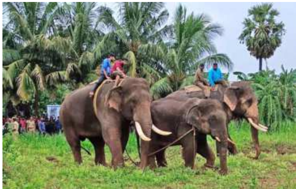
Jumbo rescue: Kumkis Jayanth and Vinayak with a wild elephant at 190-Ramapuram village in Chittoor.

A team of forest officials from Chittoor rushed to Ramapuram village. About 100 personnel, including watchers, animal trackers and beat officers from six ranges in Chittoor and Tirupati districts were deployed for 'Operation Gaja'